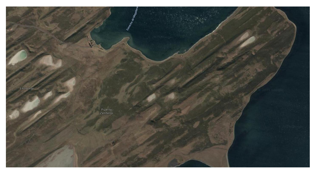
Figure 5. General area of "Punta Zenteno" Military Range (Cold steppe terrain)