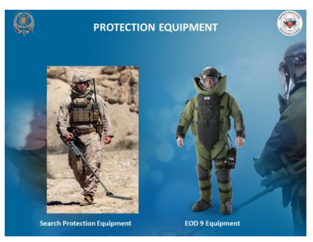
Figure 7. Protection Equipment.