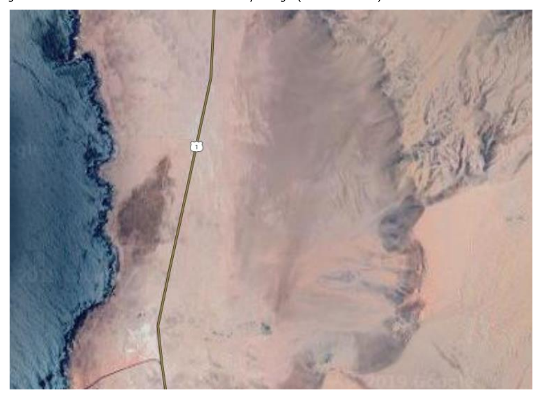
Figure 4. General area of " Delta " Military Range (Desert terrain)