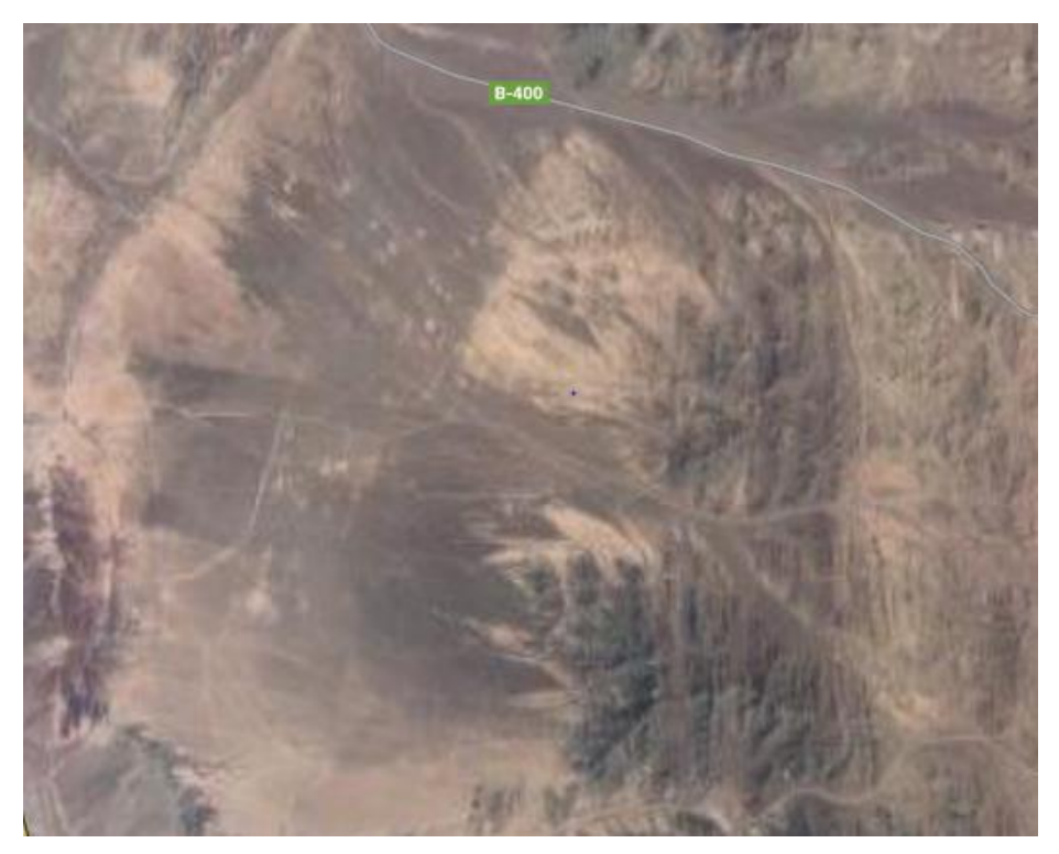
Figure 3. General area of "Barrancas" Military Range (Desert terrain).