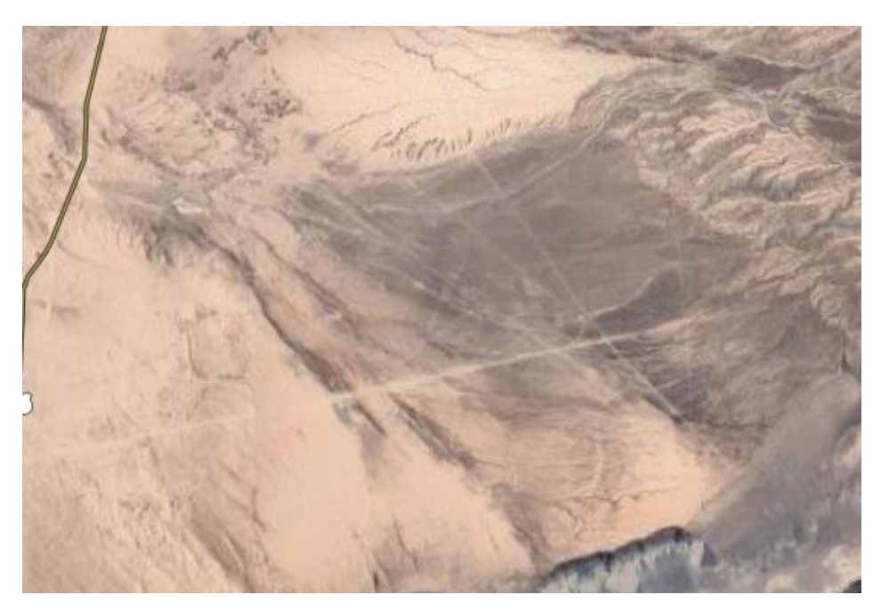
Figure 2. General area of "Pampa de Chaca Este" Military Range (Desert terrain).