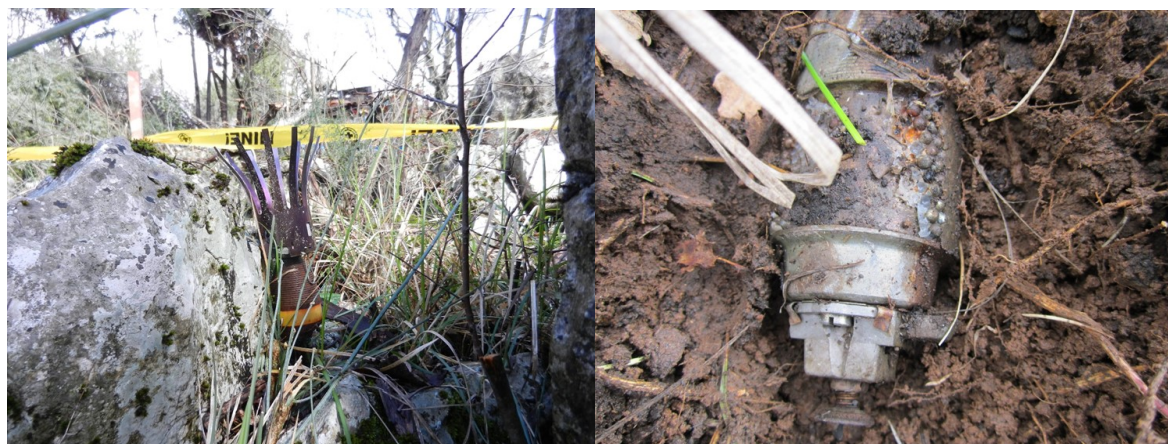
Type of cluster munition used and found in Bosnia and Herzegovina