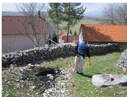
Photo 2 and 3 – Everyday life close to the area contaminated by cluster munitions